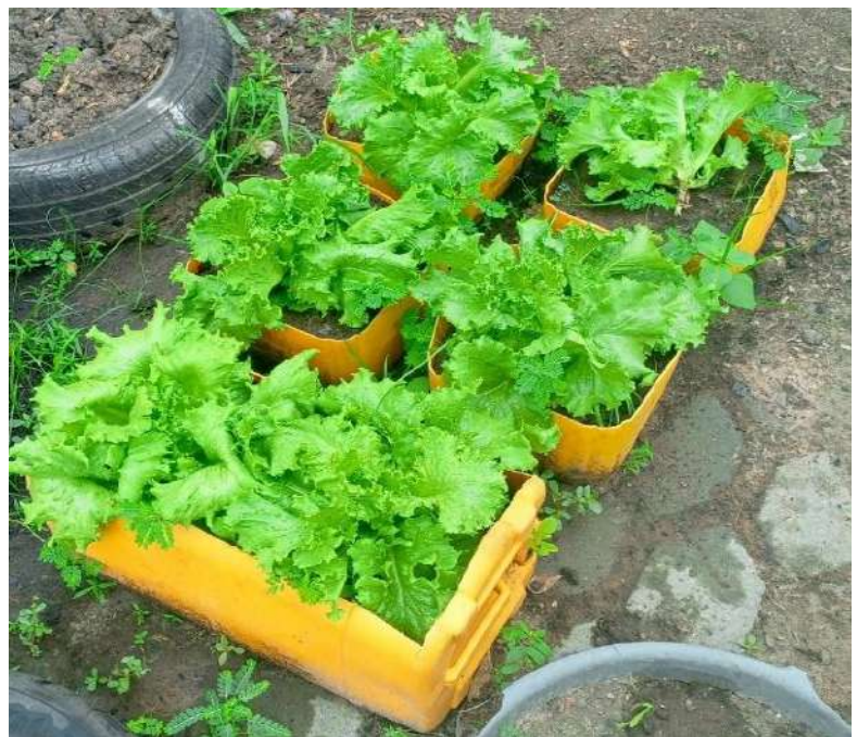
Container gardening at Tema West Municipal Office Premises