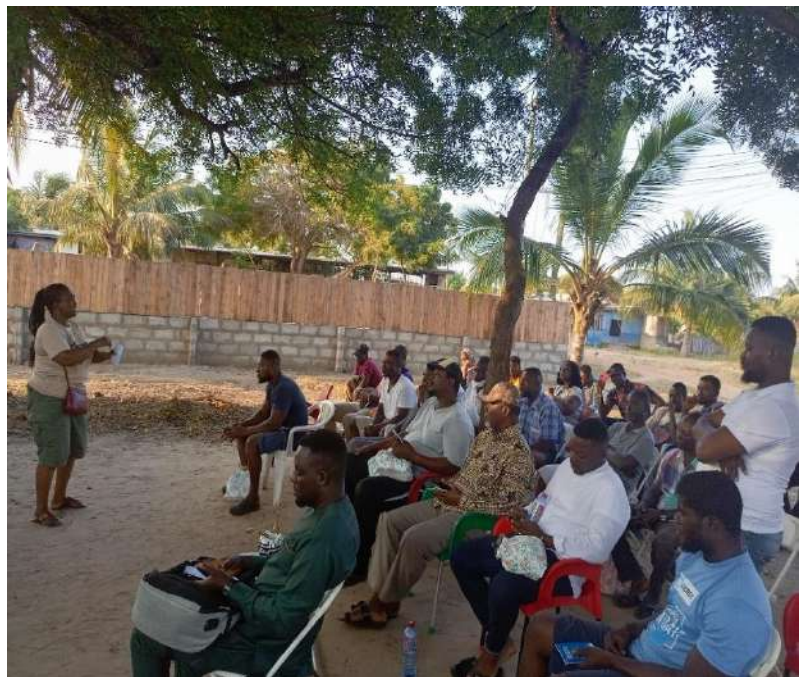
Sensitization of farmers on Climate smart agriculture and proper disposal of agro-chemical containers