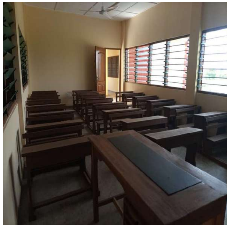
COMPLETION OF COMMUNITY LIBRARY AT SAKUMONO