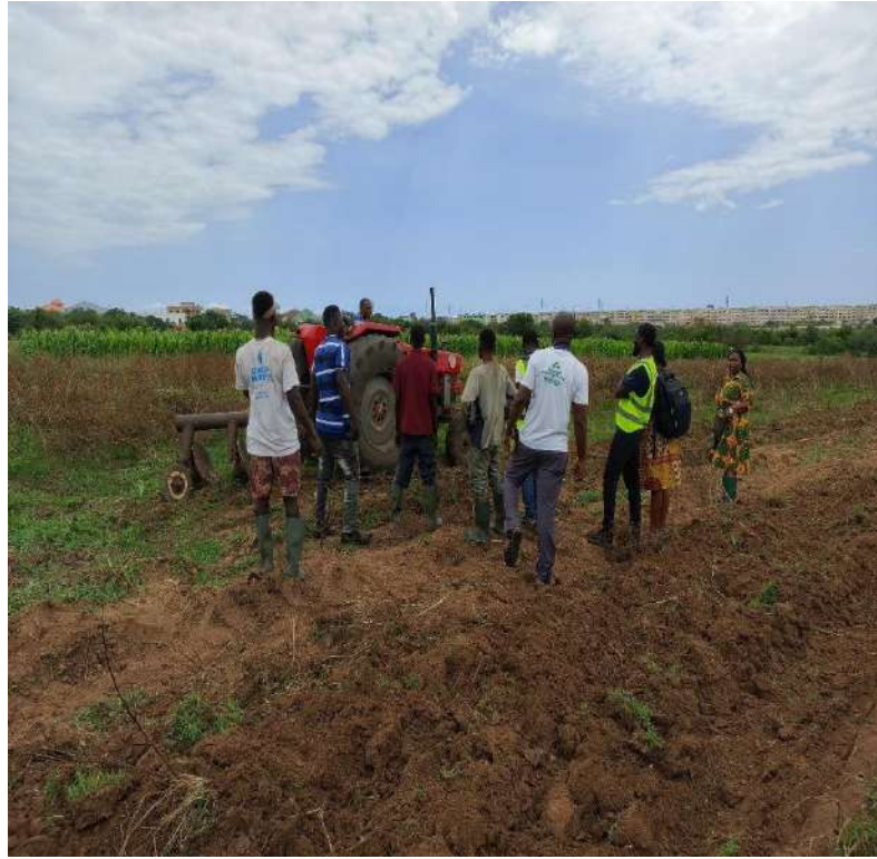
Training on Agricultural Land preparation (tractor operation)