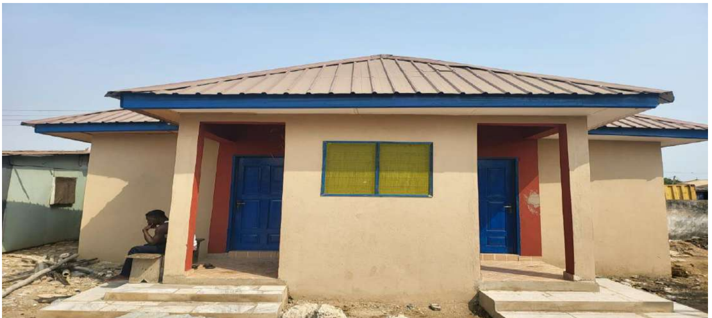
CONSTRUCTED OF 10-SEATER WC TOILET AT TEXPO MARKET