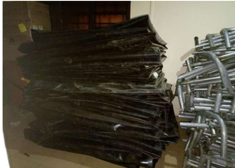
Trained farmers on catfish production and technical support to establish catfish farms