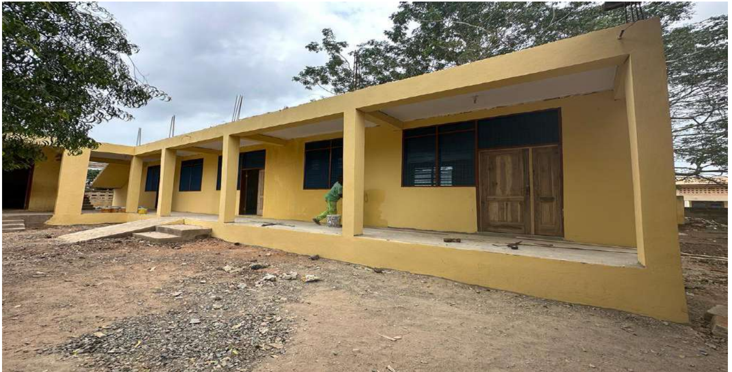
CONSTRUCTION OF 6 UNIT MODERN CLASSROOM BLOCK AT ADJEI KOJO