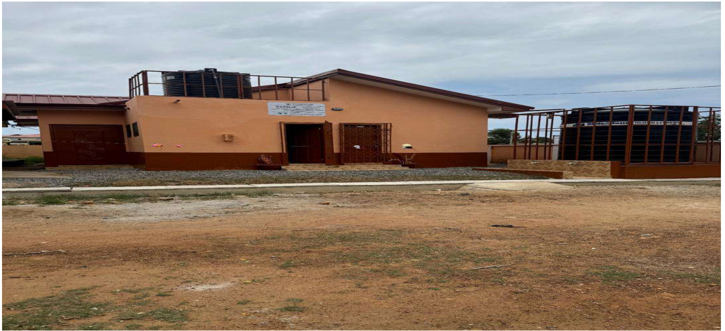
CONSTRUCTED 10-SEATER WC TOILET AT NUMBER 1 BASIC SCHOOL, COMM 5