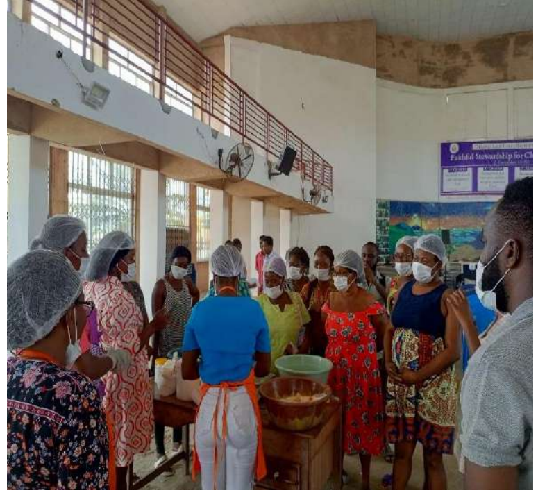
Demonstration on utilization of local foods and value addition at Lashibi and Kanewu