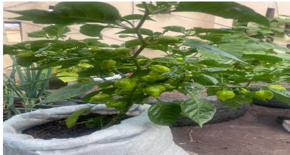
Container gardening at Tema West Municipal Office Premises