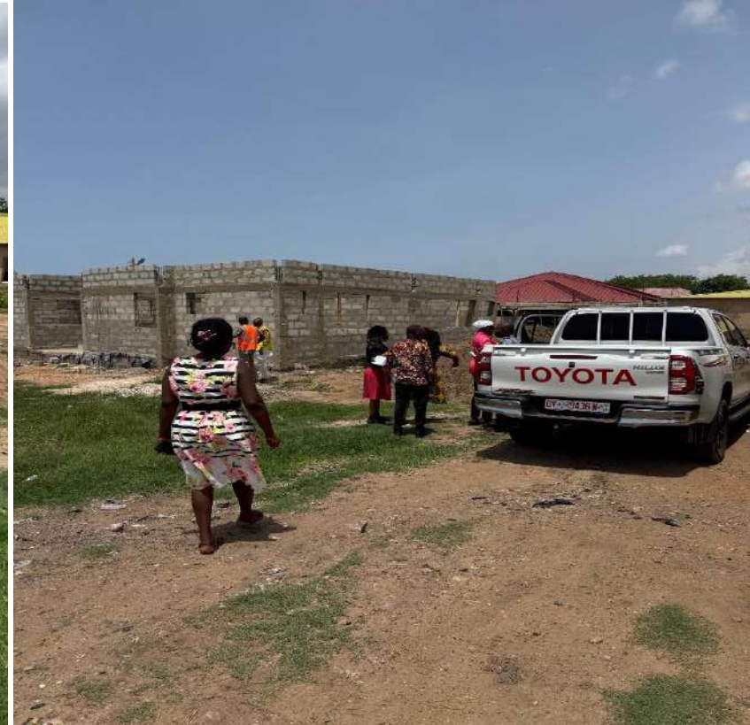
CONSTRUCTION OF 4 UNIT TEACHERS BANGALOW AT ADJEI SCHOOL COMPLEX (ON-GOING)