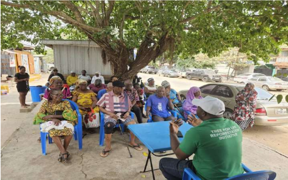
Community Sensitization on LEAP RE-ENROLMENT & Disbursement