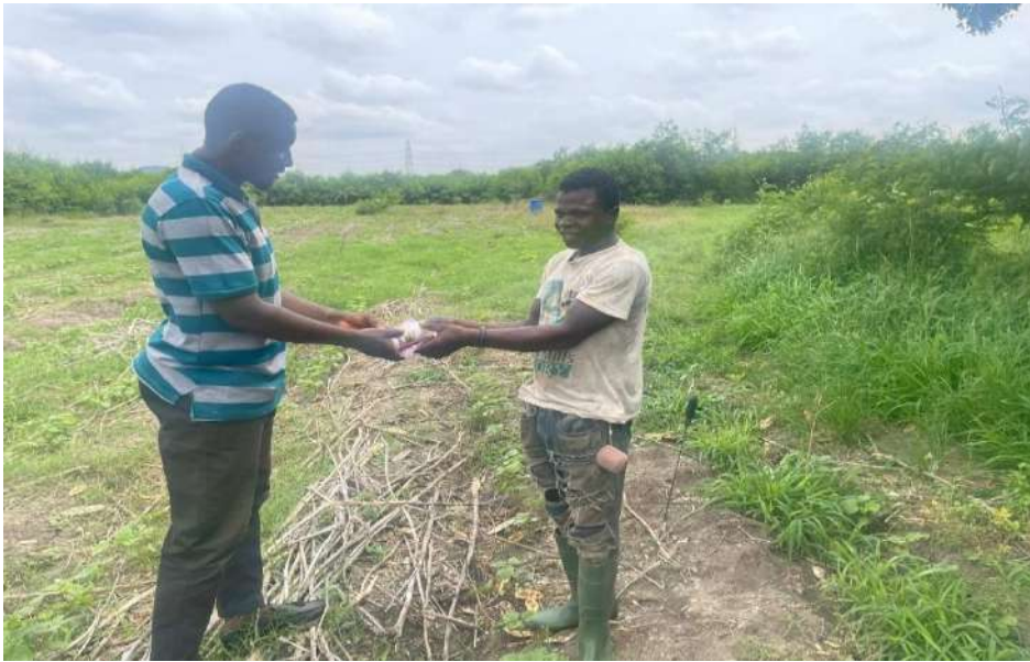
Distribution of free agrochemicals to farmers