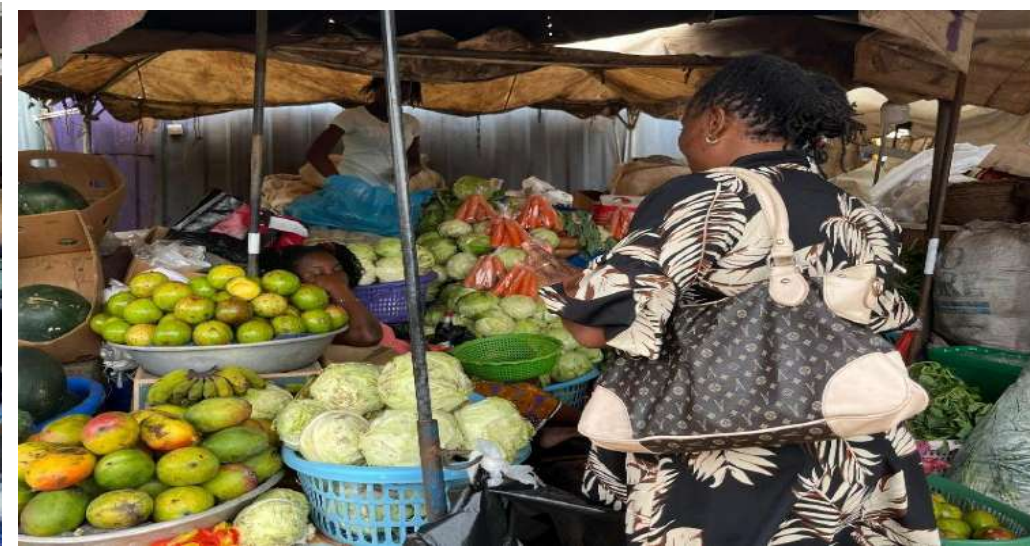
Sensitization program on gender mainstreaming and HIV & AIDS awareness at TWMA premises and Texpo Market