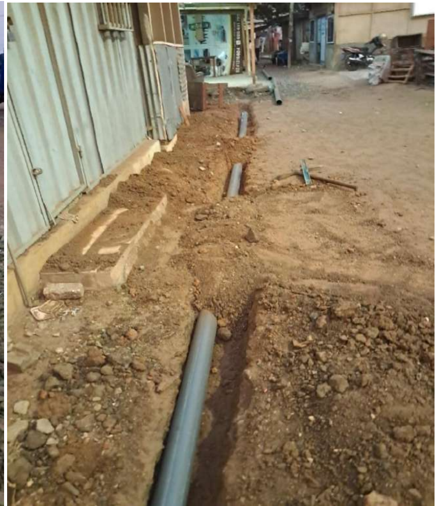
Replacement of broken sewer pipes and Construction of intermediary manholes at Community 5 Market and Community 5 B road Area