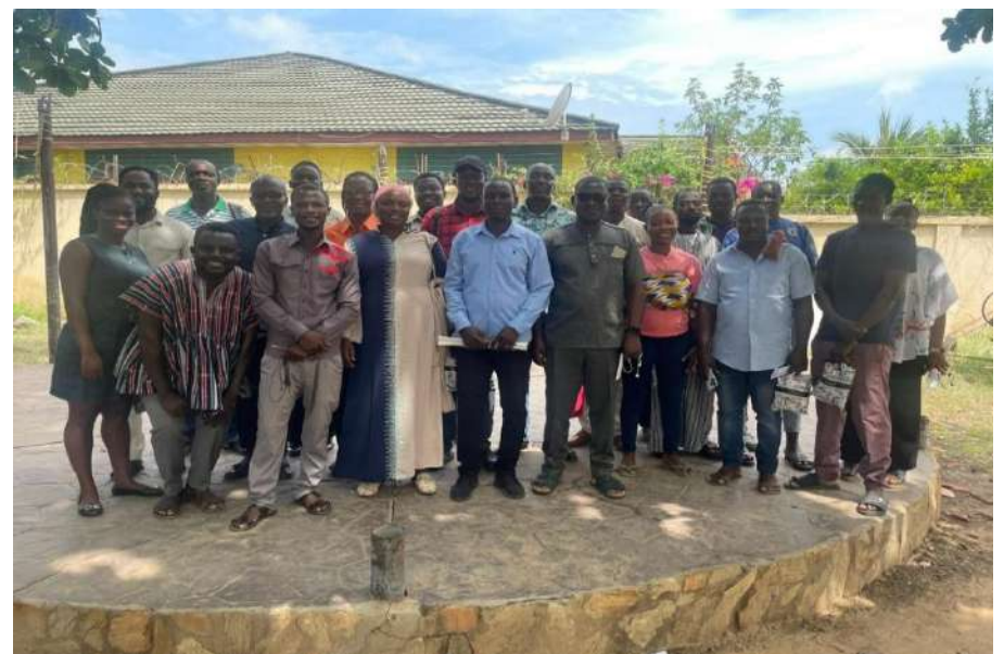
Sensitization of farmers on Climate smart agriculture and proper disposal of agro-chemical containers.