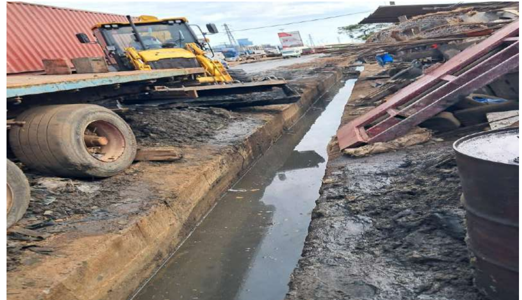
Desilting and dredging of drains from Yara Ghana to behind the Mexico School and inner drains at Community 2