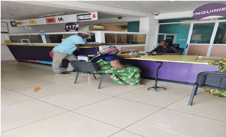
Community Sensitization on LEAP RE-ENROLMENT & Disbursement