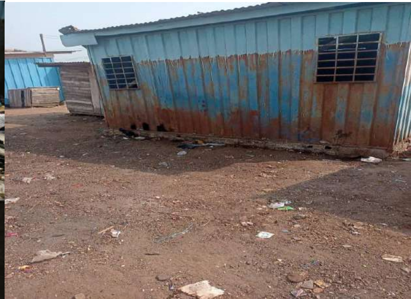
Refuse Evacuation of identified waste hotspots at Texpo Market