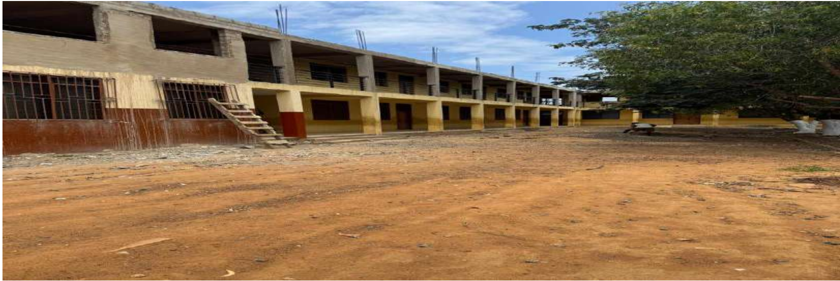
CONSTRUCTED 12-UNIT CLASSROOM BLOCK AT STAR BASIC SCHOOL (PHASE II)