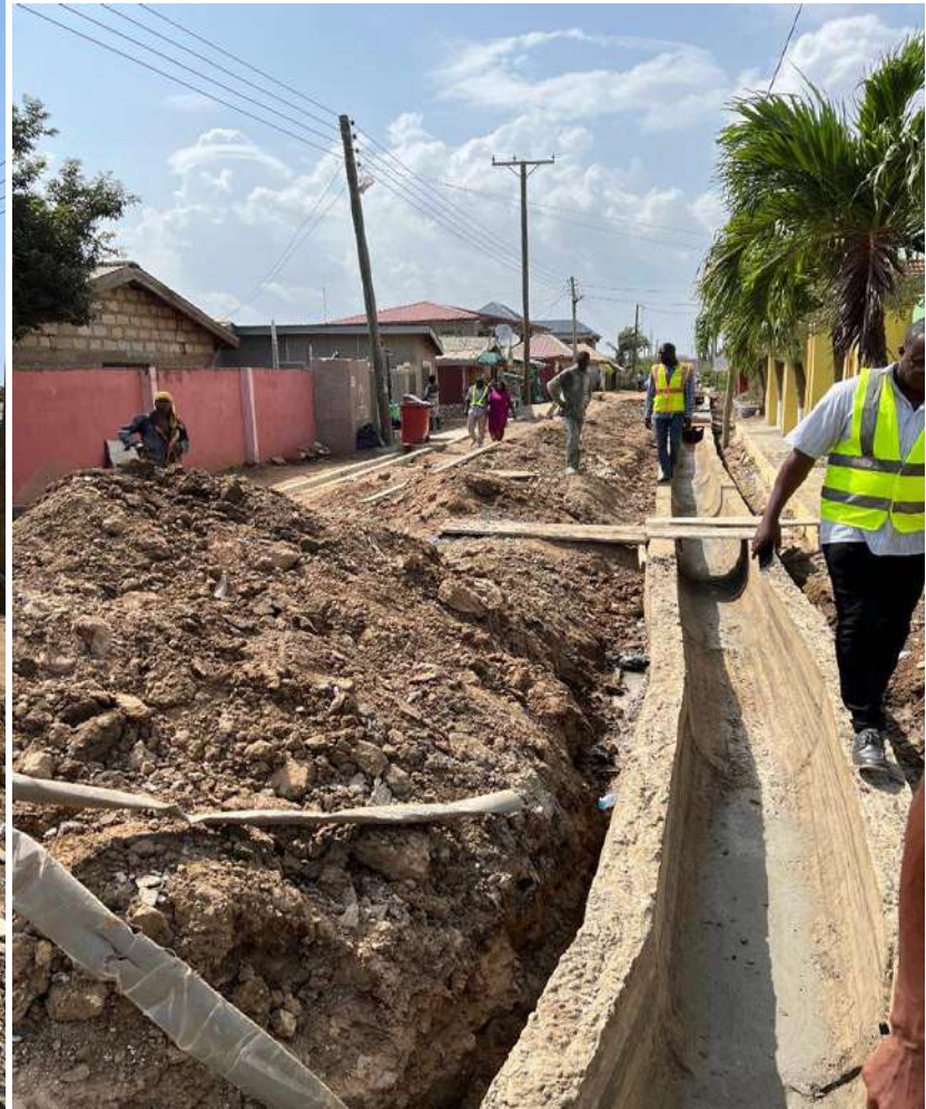
CONSTRUCTION OF U-DRAINS WITHIN THE MUNICIPALITY