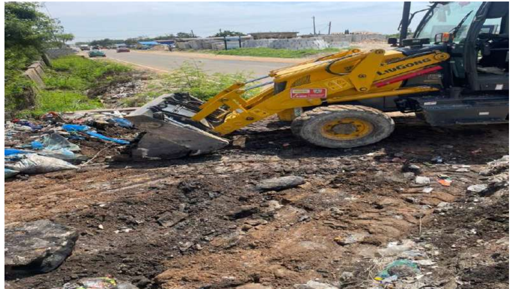
Refuse Evacuation of identified waste hotspots (Sakumono beach, Toyota Area)