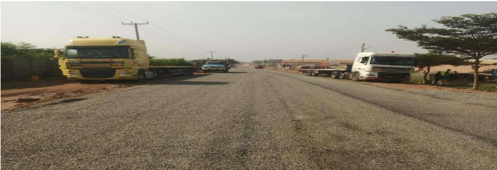
GRAVELLED AND SPOT IMPROVEMENT OF ROADS WITHIN THE MUNICIPALITY