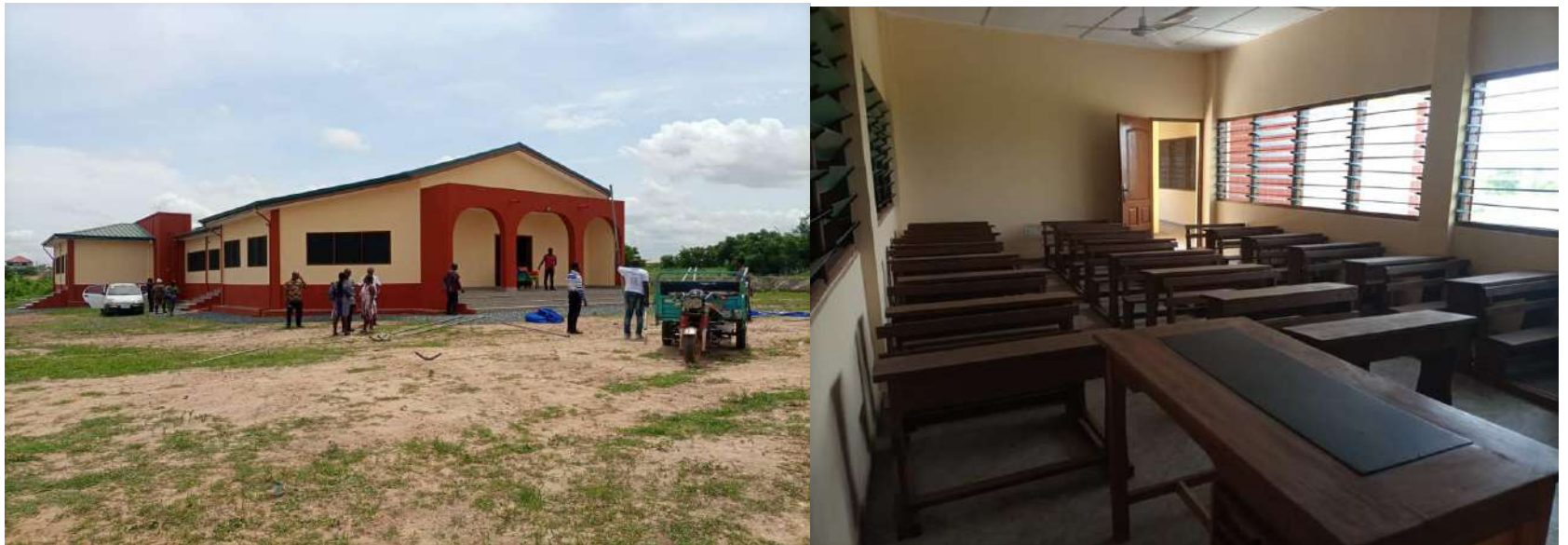
CONSTRUCTED 6 UNIT MODERN CLASSROOM BLOCK AT ADJEI KOJO