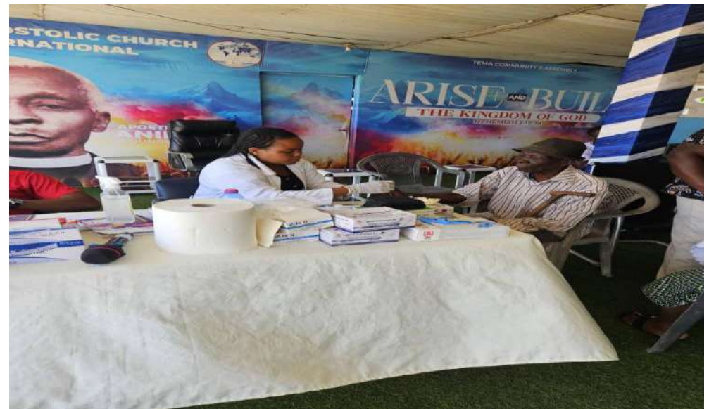
Health Screening for Older Persons within the Municipality