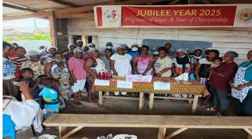
Demonstration on utilization of local foods and value addition at Lashibi and Kanewu