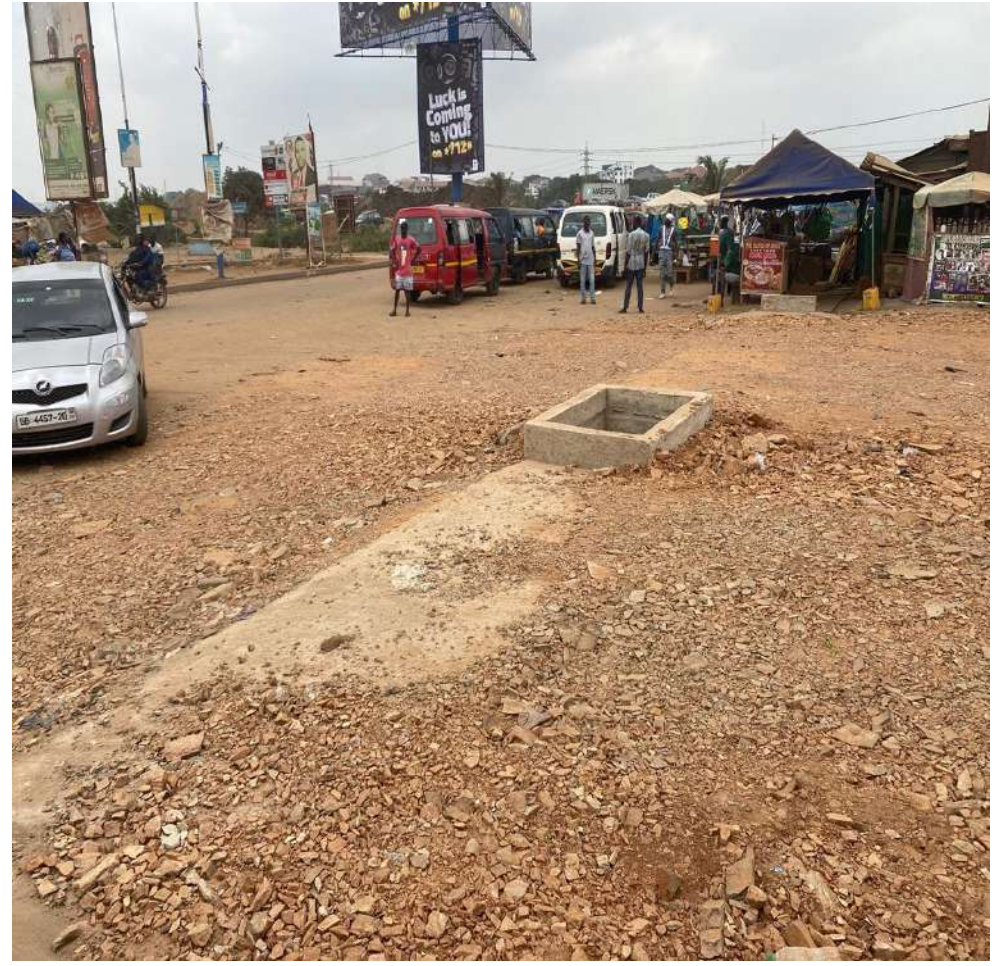
CONSTRUCTION OF DAMAGE ACCESS SLAB AT ADJEI KOJO UNDER BRIDGE STATION