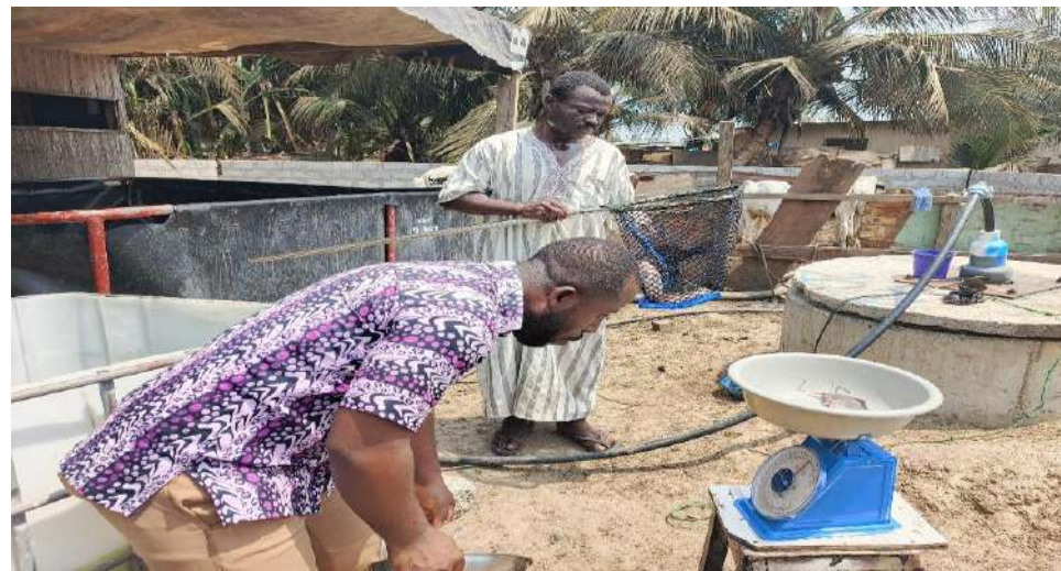
Trained farmers on catfish production and technical support to establish catfish farms